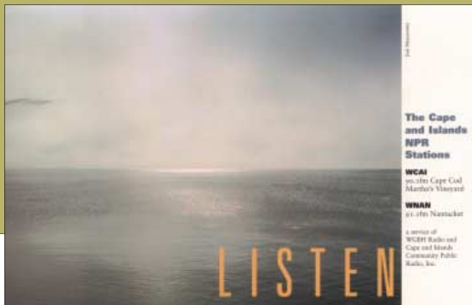
Promotional postcard for the stations of Atlantic Public Media.

The Radio Exchange ( www.radioexchange.org ) will be an on-line clearinghouse that brings new voices to public radio.